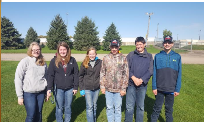
General Livestock Team