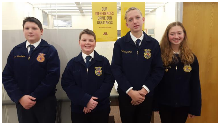
Ag Sales Team

which is indicative of our young chapter that is still getting experience in the team competitions.